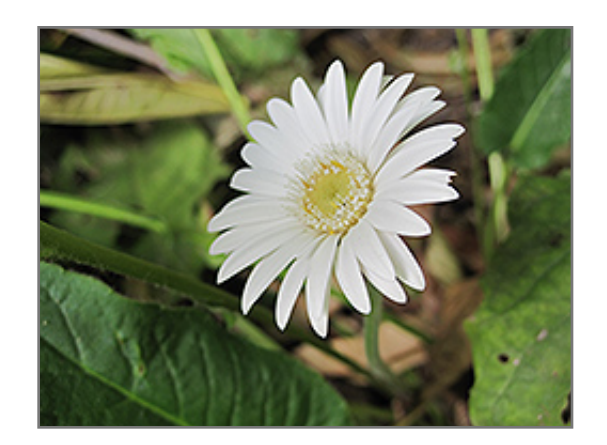
White Drakensberg Daisy Hardy Garden Gerbera flowers