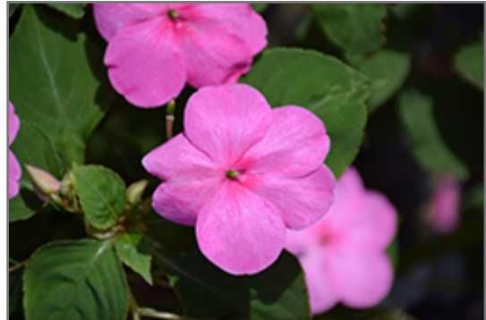
Lollipop Bubblegum Pink Impatiens flowers