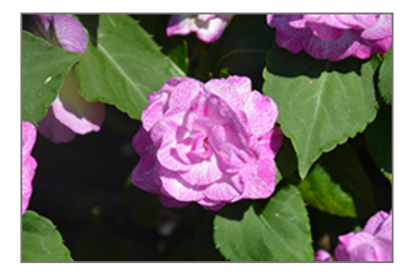
Rockapulco Wisteria Impatiens flowers