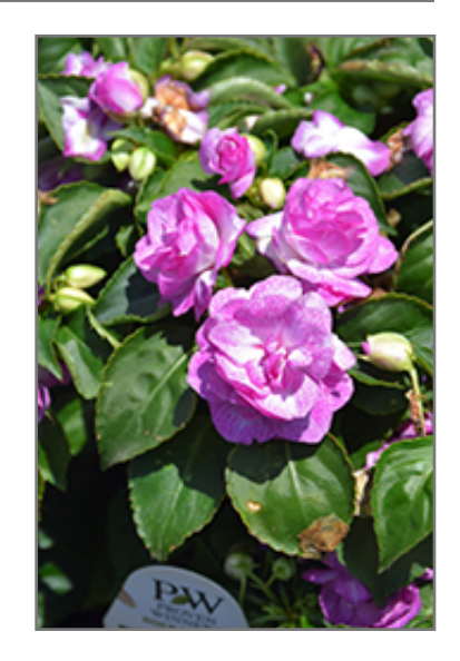
Rockapulco Wisteria Impatiens flowers