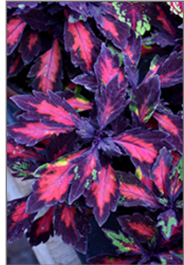
Marquee Special Effects Coleus foliage