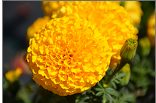
Taishan Gold Marigold flowers