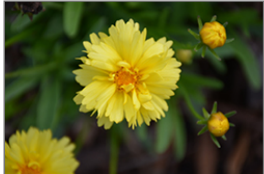
Leading Lady Charlize Tickseed flowers