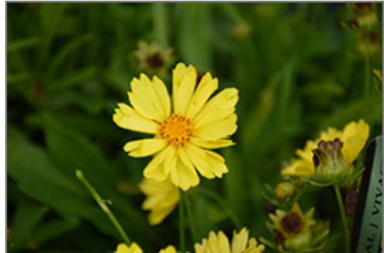
Leading Lady Sophia Tickseed flowers