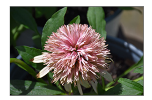
Cone-fections Cherry Fluff Coneflower flowers