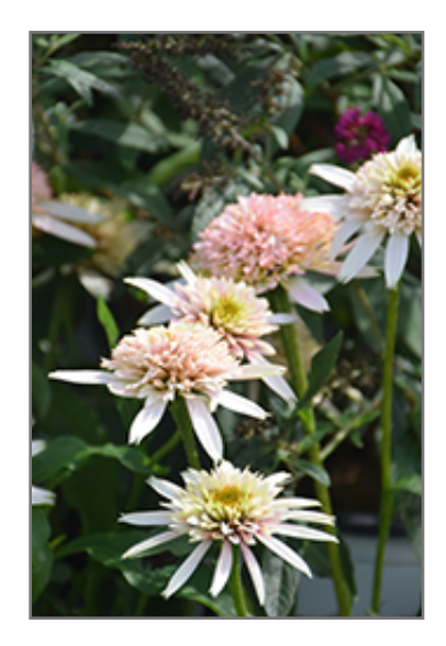
Cone-fections Cherry Fluff Coneflower flowers