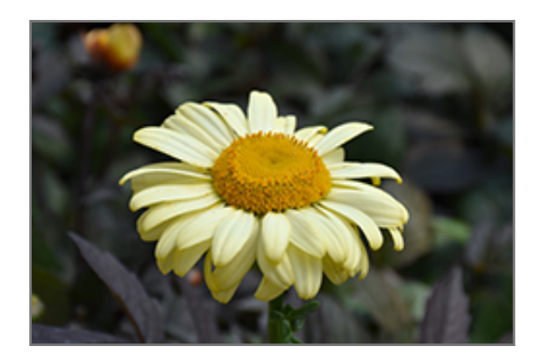
Spellbook Lumos Shasta Daisy flowers