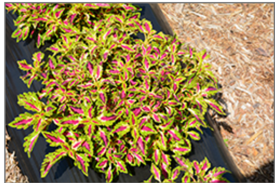
Terra Nova Jitters Coleus