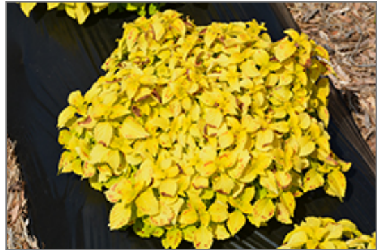
Terra Nova Pepperpot Coleus Photo courtesy of NetPS Plant Finder