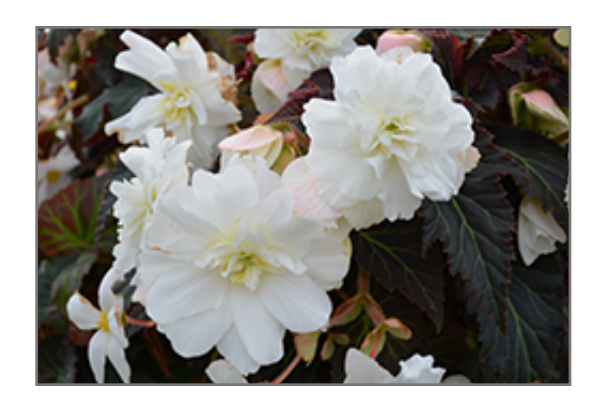
Nonstop Joy Mocca White Begonia flowers

17999 WCR 4 Brighton, CO, 80603 phone: 303-775-9629 www.incolorme.com