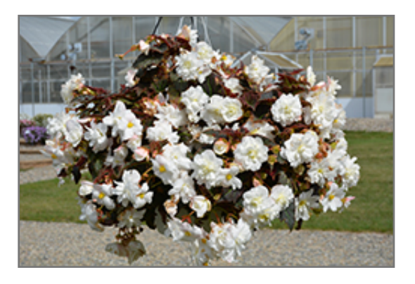
Nonstop Joy Mocca White Begonia in bloom