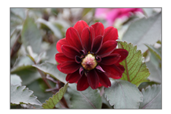
Dalina Grande Castillo Dahlia flowers

17999 WCR 4 Brighton, CO, 80603 phone: 303-775-9629 www.incolorme.com