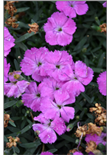
Paint The Town Fuchsia Pinks flowers

Paint The Town Fuchsia Pinks is recommended for the following landscape applications;