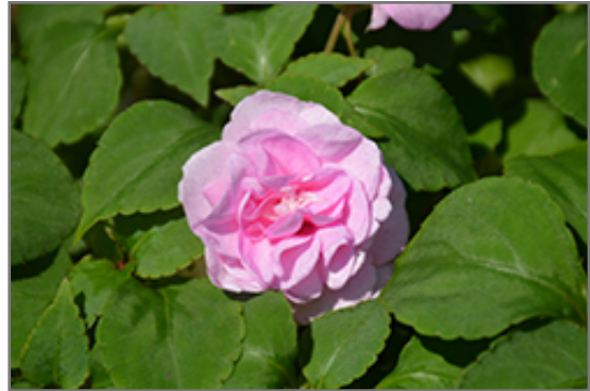
Rockapulco Orchid Impatiens flowers