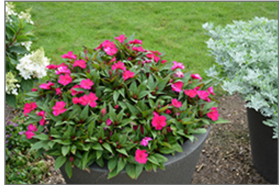
SunPatiens Compact Neon Pink New Guinea Impatiens in bloom

SunPatiens Compact Neon Pink New Guinea Impatiens will grow to be about 24 inches tall at maturity, with a spread of 24 inches. When grown in masses or used as a bedding plant, individual plants should be spaced approximately 20 inches apart. Its foliage tends to remain dense right to the ground, not requiring facer plants in front. This fast-growing annual will normally live for one full growing season, needing replacement the following year.