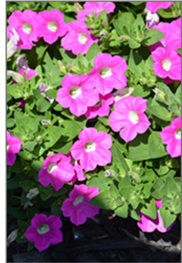
Blanket Rose Petunia flowers