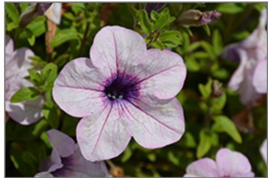
Surfinia Sumo Glacial Pink Petunia flowers