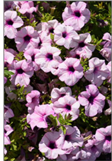
Surfinia Sumo Glacial Pink Petunia flowers

Surfinia Sumo Glacial Pink Petunia is recommended for the following landscape applications;