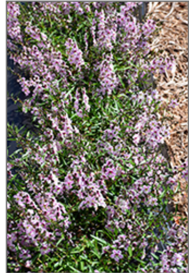
Pinstripe Vintage Pink Angelonia in bloom

Pinstripe Vintage Pink Angelonia is a fine choice for the garden, but it is also a good selection for planting in outdoor containers and hanging baskets. It is often used as a 'filler' in the 'spiller-thriller-filler' container combination, providing a mass of flowers against which the larger thriller plants stand out. Note that when growing plants in outdoor containers and baskets, they may require more frequent waterings than they would in the yard or garden.