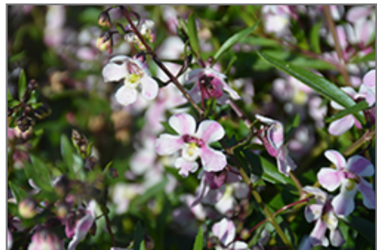
Pinstripe Vintage Pink Angelonia flowers