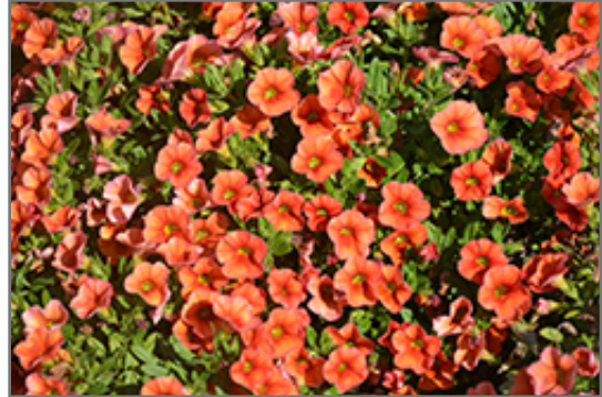
Catwalk Mandarin Glow Calibrachoa flowers

Catwalk Mandarin Glow Calibrachoa will grow to be about 8 inches tall at maturity, with a spread of 18 inches. When grown in masses or used as a bedding plant, individual plants should be spaced approximately 10 inches apart. Its foliage tends to remain low and dense right to the ground. This fast-growing annual will normally live for one full growing season, needing replacement the following year.