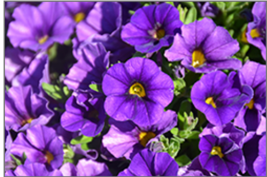
Catwalk Perfect Purple Calibrachoa flowers