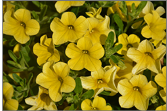
Catwalk Perfect Yellow Calibrachoa flowers