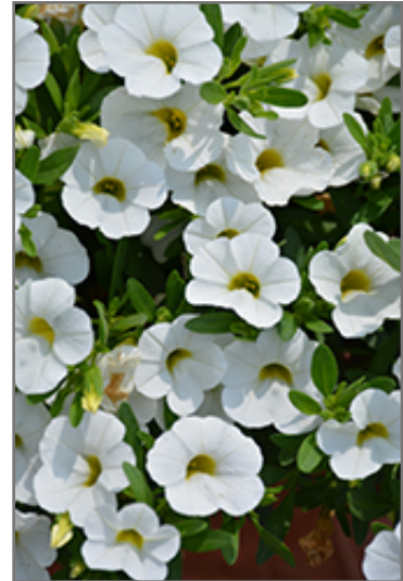
Catwalk Pure Cotton Calibrachoa flowers

Catwalk Pure Cotton Calibrachoa is recommended for the following landscape applications;