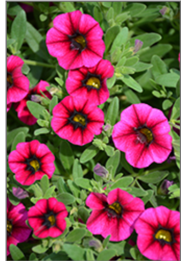
Kimono Black Dragon Calibrachoa flowers

Kimono Black Dragon Calibrachoa is recommended for the following landscape applications;