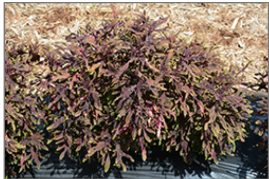
Under The Sea Lion Fish Coleus