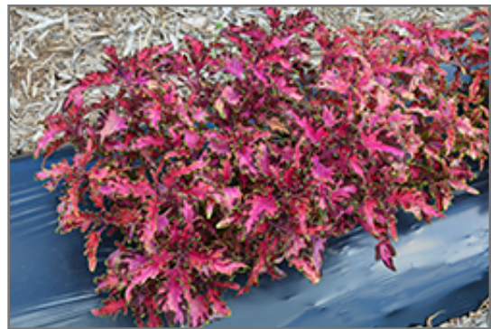
Under The Sea Pink Reef Coleus