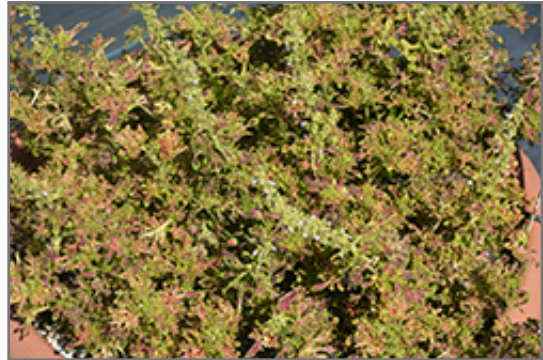
Under The Sea Red Coral Coleus foliage

Under The Sea Red Coral Coleus is a fine choice for the garden, but it is also a good selection for planting in outdoor containers and hanging baskets. It can be used either as 'filler' or as a 'thriller' in the 'spiller-thriller-filler' container combination, depending on the height and form of the other plants used in the container planting. Note that when growing plants in outdoor containers and baskets, they may require more frequent waterings than they would in the yard or garden.