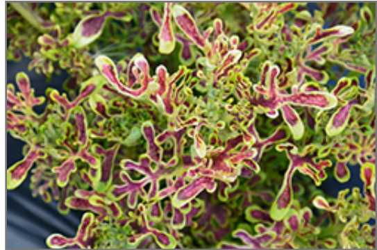
Under The Sea Red Coral Coleus foliage