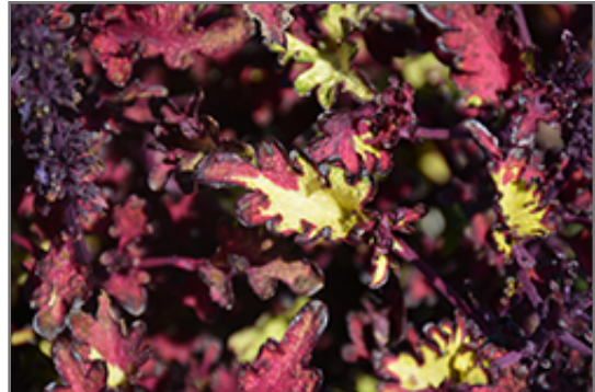
Under the Sea Sea Monkey Rust Coleus foliage