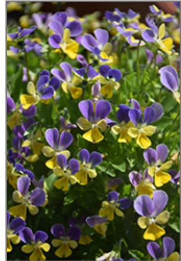
Hip Hop Bluebunny Pansy flowers

Hip Hop Bluebunny Pansy is recommended for the following landscape applications;