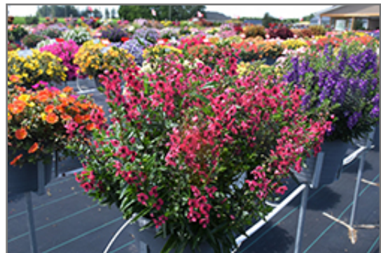
Archangel Cherry Red Angelonia in bloom