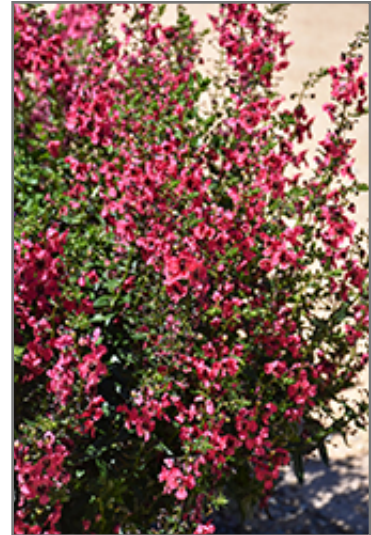
Archangel Cherry Red Angelonia flowers

This plant will require occasional maintenance and upkeep, and should not require much pruning, except when necessary, such as to remove dieback. It is a good choice for attracting butterflies to your yard, but is not particularly attractive to deer who tend to leave it alone in favor of tastier treats. It has no significant negative characteristics.