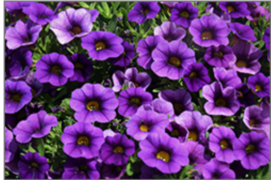
Calipetite Blue Calibrachoa flowers

Calipetite Blue Calibrachoa is recommended for the following landscape applications;