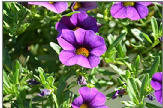
Calipetite Blue Calibrachoa flowers