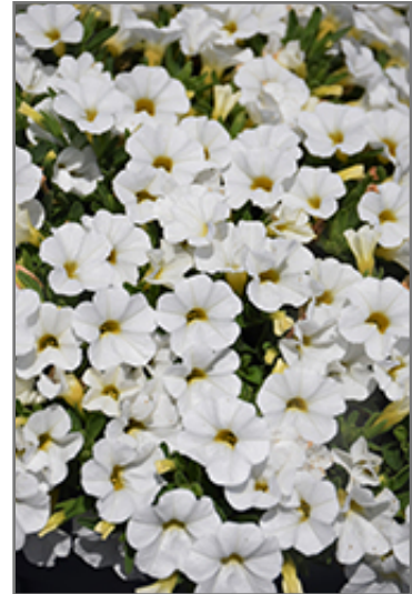
Calipetite White Calibrachoa flowers

Calipetite White Calibrachoa is recommended for the following landscape applications;