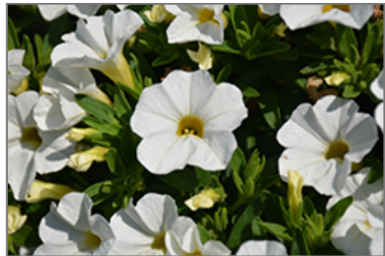
Calipetite White Calibrachoa flowers