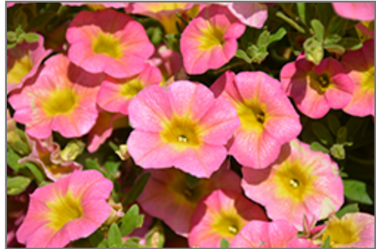
Callie Pink Morn Calibrachoa flowers