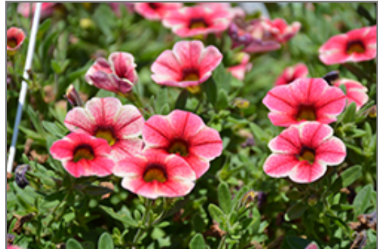
Crave Strawberry Star Calibrachoa flowers