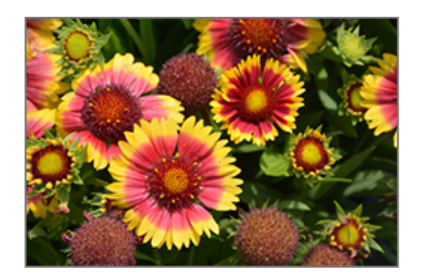
Sunset Flash Blanket Flower flowers