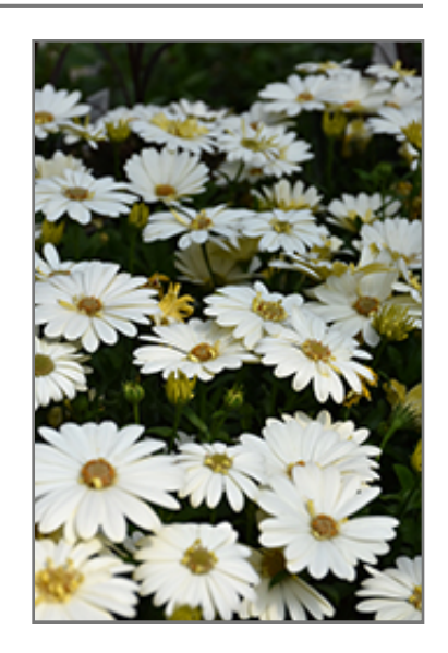
3D Lemon Ice African Daisy flowers