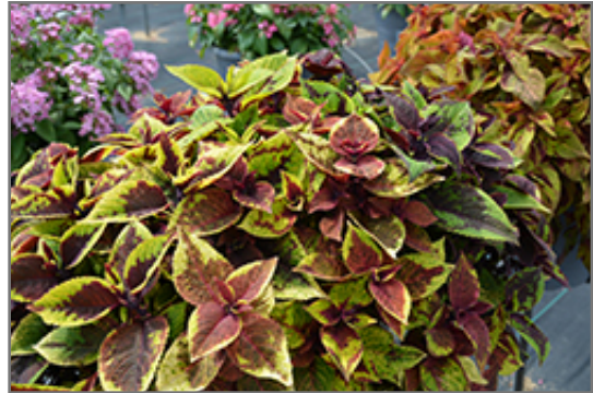
Premium Sun Pineapple Surprise Coleus

Premium Sun Pineapple Surprise Coleus is a fine choice for the garden, but it is also a good selection for planting in outdoor containers and hanging baskets. With its upright habit of growth, it is best suited for use as a 'thriller' in the 'spiller-thriller-filler' container combination; plant it near the center of the pot, surrounded by smaller plants and those that spill over the edges. It is even sizeable enough that it can be grown alone in a suitable container. Note that when growing plants in outdoor containers and baskets, they may require more frequent waterings than they would in the yard or garden.