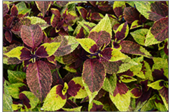
Premium Sun Pineapple Surprise Coleus foliage