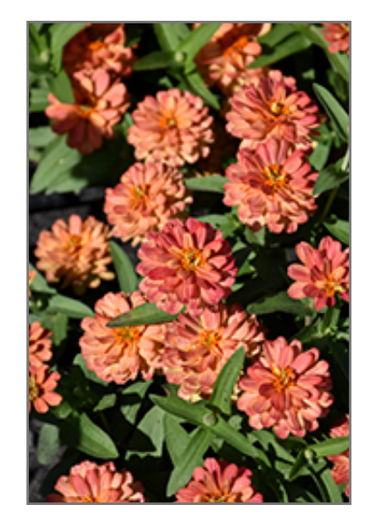
Zahara Double Deep Salmon Zinnia flowers