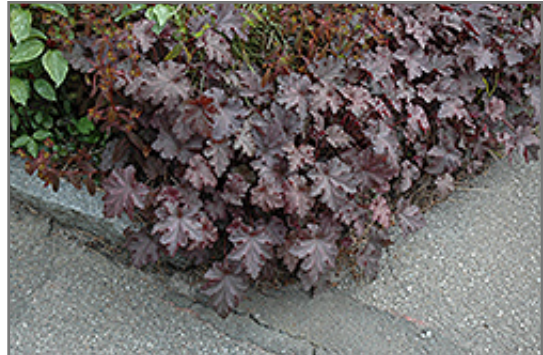
Stormy Seas Coral Bells