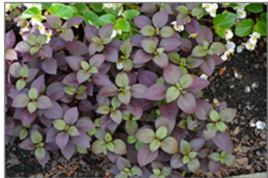
Purple Prince Alternanthera foliage