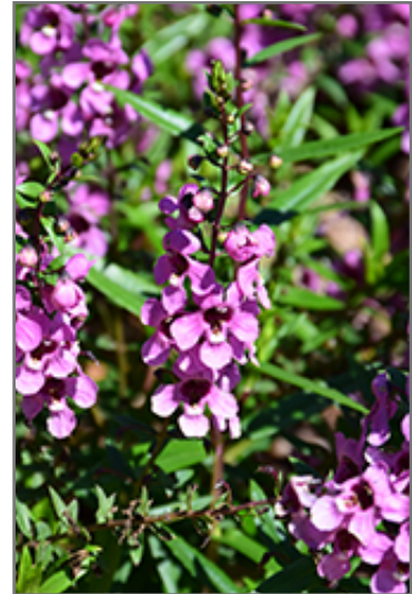
Sungelonia Pink Angelonia flowers