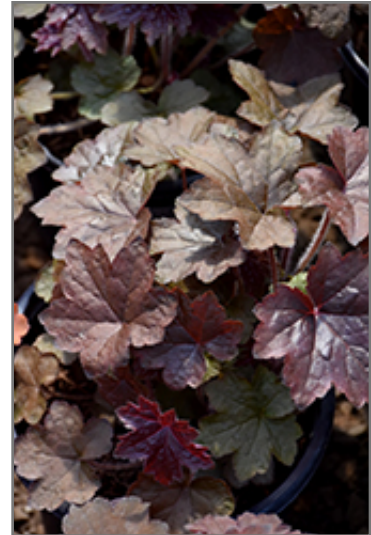
Palace Purple Coral Bells foliage