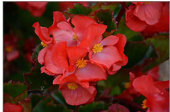
Megawatt Red Green Leaf Begonia flowers