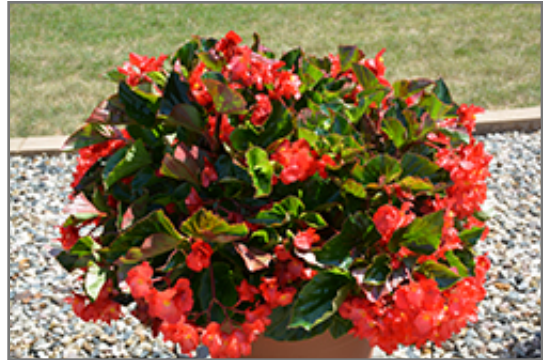
Megawatt Red Green Leaf Begonia in bloom

Megawatt Red Green Leaf Begonia is a fine choice for the garden, but it is also a good selection for planting in outdoor containers and hanging baskets. With its upright habit of growth, it is best suited for use as a 'thriller' in the 'spiller-thriller-filler' container combination; plant it near the center of the pot, surrounded by smaller plants and those that spill over the edges. It is even sizeable enough that it can be grown alone in a suitable container. Note that when growing plants in outdoor containers and baskets, they may require more frequent waterings than they would in the yard or garden.