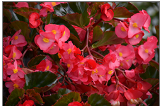
Megawatt Rose Bronze Leaf Begonia flowers