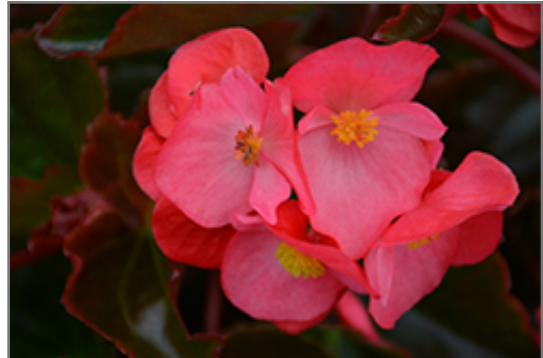
Megawatt Rose Bronze Leaf Begonia flowers

This is a high maintenance plant that will require regular care and upkeep, and usually looks its best without pruning, although it will tolerate pruning. Deer don't particularly care for this plant and will usually leave it alone in favor of tastier treats. Gardeners should be aware of the following characteristic(s) that may warrant special consideration;