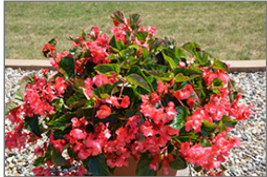
Megawatt Rose Green Leaf Begonia in bloom

Megawatt Rose Green Leaf Begonia is a fine choice for the garden, but it is also a good selection for planting in outdoor containers and hanging baskets. With its upright habit of growth, it is best suited for use as a 'thriller' in the 'spiller-thriller-filler' container combination; plant it near the center of the pot, surrounded by smaller plants and those that spill over the edges. It is even sizeable enough that it can be grown alone in a suitable container. Note that when growing plants in outdoor containers and baskets, they may require more frequent waterings than they would in the yard or garden.