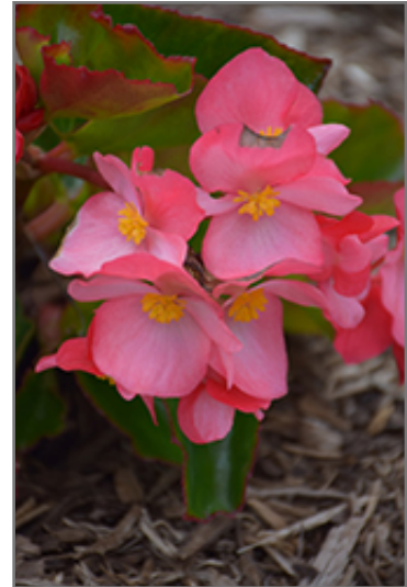
Megawatt Rose Green Leaf Begonia flowers

This is a high maintenance plant that will require regular care and upkeep, and usually looks its best without pruning, although it will tolerate pruning. Deer don't particularly care for this plant and will usually leave it alone in favor of tastier treats. Gardeners should be aware of the following characteristic(s) that may warrant special consideration;