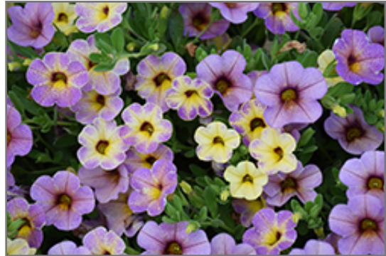
Chameleon Blueberry Scone Calibrachoa flowers

This plant will require occasional maintenance and upkeep. Trim off the flower heads after they fade and die to encourage more blooms late into the season. It is a good choice for attracting bees and hummingbirds to your yard, but is not particularly attractive to deer who tend to leave it alone in favor of tastier treats. It has no significant negative characteristics.