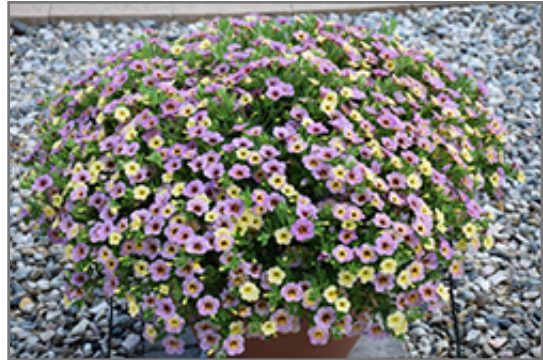
Chameleon Blueberry Scone Calibrachoa in bloom

Chameleon Blueberry Scone Calibrachoa is a fine choice for the garden, but it is also a good selection for planting in outdoor containers and hanging baskets. Because of its trailing habit of growth, it is ideally suited for use as a 'spiller' in the 'spiller-thriller-filler' container combination; plant it near the edges where it can spill gracefully over the pot. Note that when growing plants in outdoor containers and baskets, they may require more frequent waterings than they would in the yard or garden.