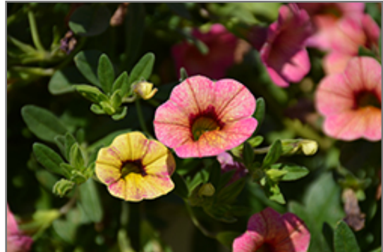
Chameleon Melon Berry Calibrachoa flowers