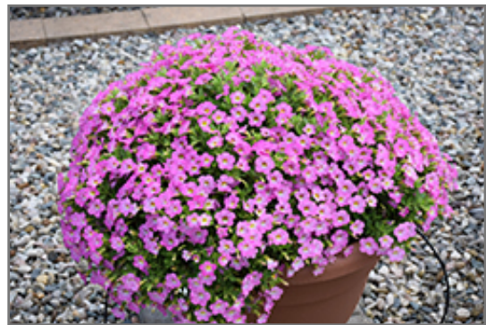
Chameleon Pink Passion Calibrachoa in bloom