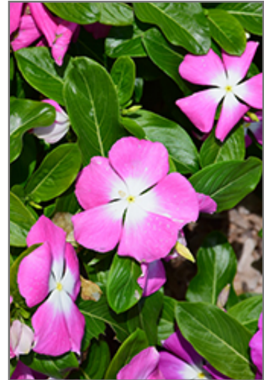
Mega Bloom Pink Halo Vinca flowers

Mega Bloom Pink Halo Vinca is recommended for the following landscape applications;