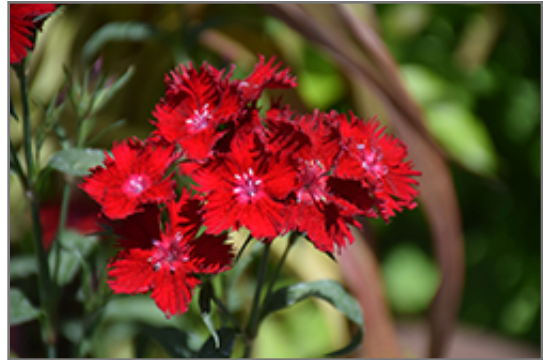
Rockin' Red Pinks flowers

Rockin' Red Pinks is recommended for the following landscape applications;