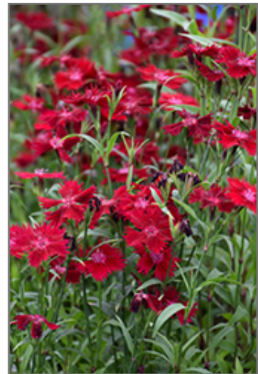
Rockin' Red Pinks flowers